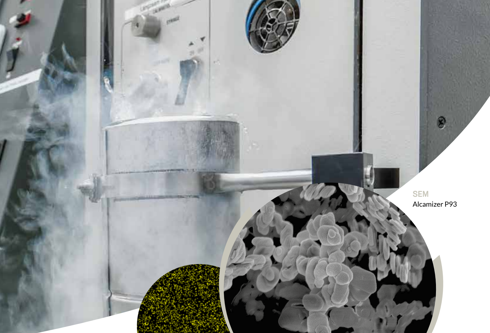
SEM Alcamizer P93